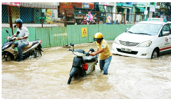
Flood in Ho Chi Minh City.

To ensure its long-term use, the DST is to be developed in cooperation with future users such as public authorities, companies and civil society. “DECIDER” will also facilitate the use of the DST in other cities that face similar adaptation pressures. Appropriate measures are to be taken during the project to specifically promote this transfer. This way, “DECIDER” can make a lasting contribution to the successful reduction of flood risk in coastal cities all over the world. The project thus supports the achievement not only of global disaster reduction objectives, but also of climate change adaptation and, ultimately, sustainable development in general.