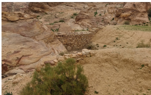
Restored historical dams in Wadi Musa in Petra, Jordan.

Time and again, the entire Middle East experiences heavy rainfalls and dramatic flash floods. In the past 50 years, flash floods have repeatedly caused deaths and tremendous property damages in Jordan. To date, the country lacks fundamental hydrological and meteorological knowledge to be able to predict the occurrence and intensity of heavy rainfalls and flash floods in wadi systems. Early warning systems therefore only work to a limited degree; it is also difficult to develop measures to minimise risks. CapTain Rain therefore aims to revise and improve the methods and instruments for forecasting and preventing flash floods currently used in Jordan and to develop recommendations for a risk management and early warning system that is tailored to the needs of its users. The project further aims to develop corresponding climate services to help the population prepare for heavy rainfalls and provide information on how to behave in the event of a disaster. Despite their destructive force, heavy rainfalls play a key role in the water cycle of (semi-) arid regions, as they replenish scarce water resources. In light of the increasing risk of droughts and water scarcity, it is therefore key that rain is collected and put to use. In this context, CapTain Rain researches measures to capture, retain and use heavy rainfalls and to improve the