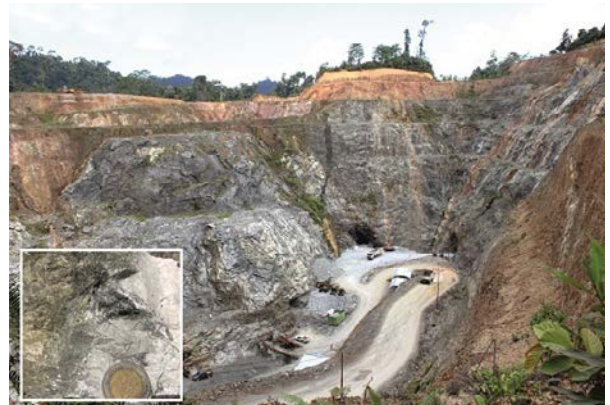
StratOre aims to develop new processing and exploration concepts.

The aim of this project is to develop innovative concepts for the efficient extraction of ESCs from Indonesian ore deposits. This is to be achieved through three case studies: a Fe-Ni laterite deposit, an Fe-Pb-Zn skarn deposit and a Cu-Ni-Co solid sulphide deposit. The work on these case studies is divided into three stages. In the first stage, the spatial and mineralogical distribution of the ESCs in the respective deposits will be investigated in detail. The results are then to be used to design concepts for the exploration, extraction and processing of ESCs. These concepts will then be validated in the third stage by means of targeted research drilling and processing experiments. In the long term, the project is expected to lead to the widespread establishment of efficient ESC recovery from relevant