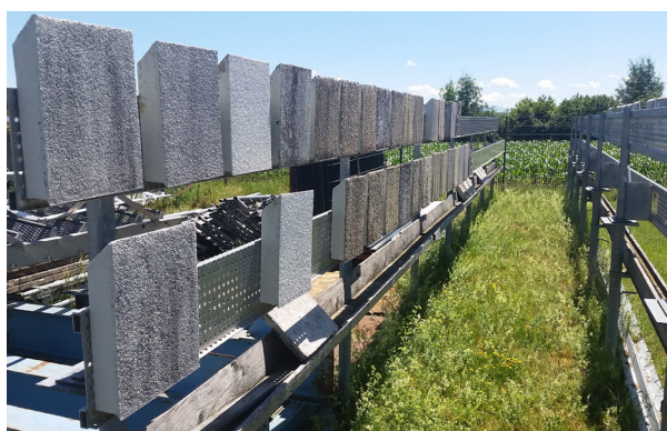
Outdoor testing facility, Fraunhofer Institute for Building Physics, Holzkirchen.

for scientific materials research and the identification of building material characteristics. A plan will also be drawn up for establishing a building physics laboratory and an outdoor testing area for material weathering. This will support the introduction of a regulatory framework on advanced engineering and energy-efficient and sustainable construction practices. In addition to this, skill-building measures will be implemented in different phases of the building life cycle.